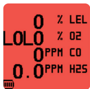
Red display in alarm conditions